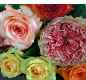
Rosa Loves Me®