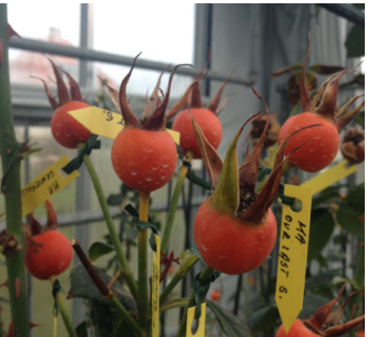
Rose hip with seeds ready for harvesting