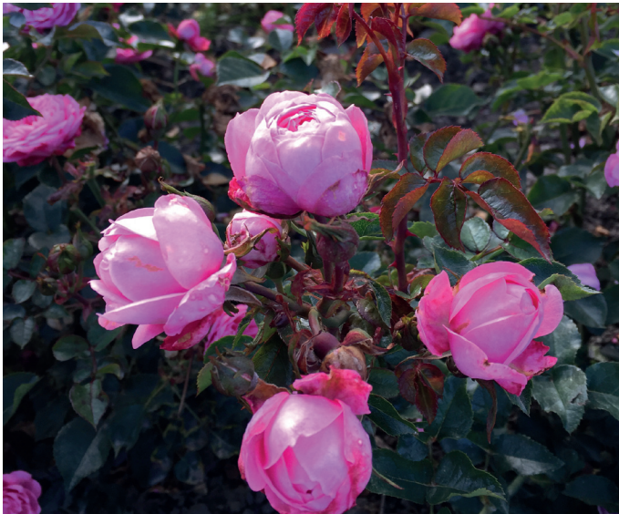
CPH Garden in Bloom™