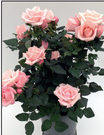
Sweet Love Forever™