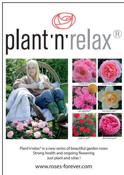
Banner, A3 or A4 sign