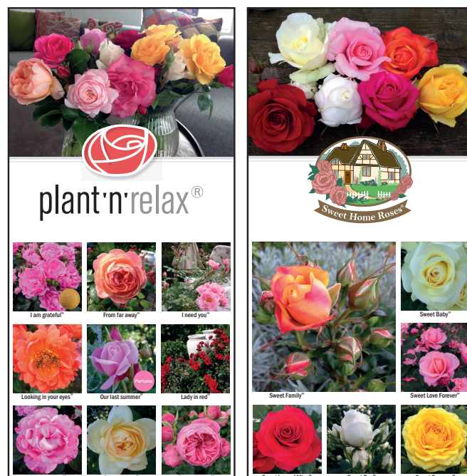
Roll-up banner 85x200cm