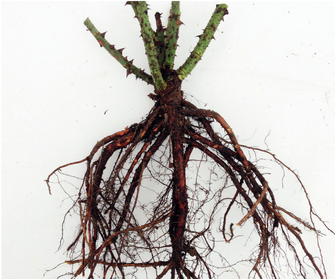
Bare rooted rose ready to plant