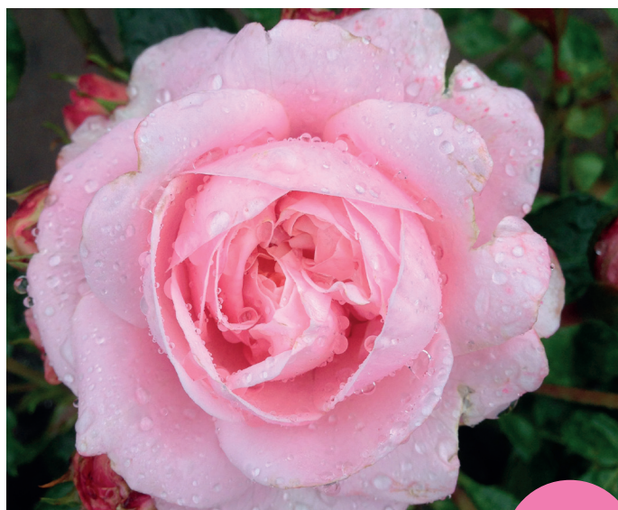
Inner Wheel Forever™