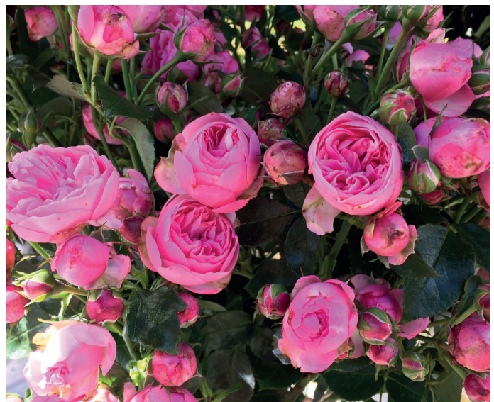
The Matador™ (syn. Lise Nørgaard™)

Floribunda rose 80-110 cm high Remontant rose Medium filled flowers in large bunches Suitable for larger beds or solitary. Also suitable in bouquets Very romantic rose with long vase life