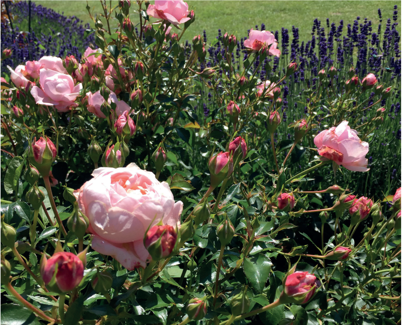
Plant'n'relax® - Remontant and healthy garden roses