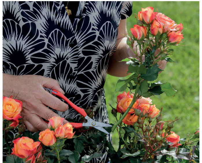
Cut beautiful bouquets

When the sun shines in spring the Plant'n'cut™ will begin to grow