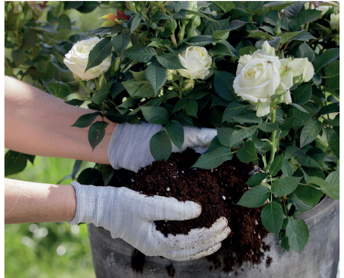
Plant the Plant'n'cut™ rose in a pot

Plant the barrooted Plant'n'cut™ rose in a pot or bed in your hobby greenhouse