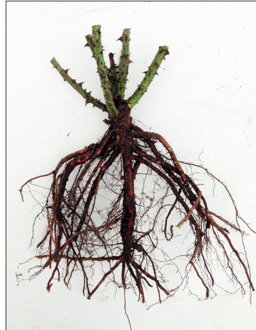
Barerooted rose ready to plant