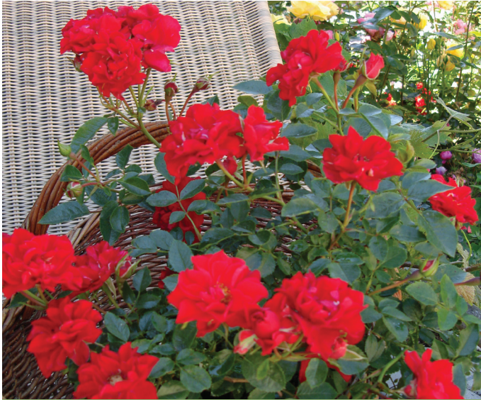
Lady in Red™

Mini ground cover rose 40-60 cm high Remontant rose Medium filled flowers with light scent Bright red semi-double flowers Use in flower beds and as a ground cover rose Also very suitable in containers