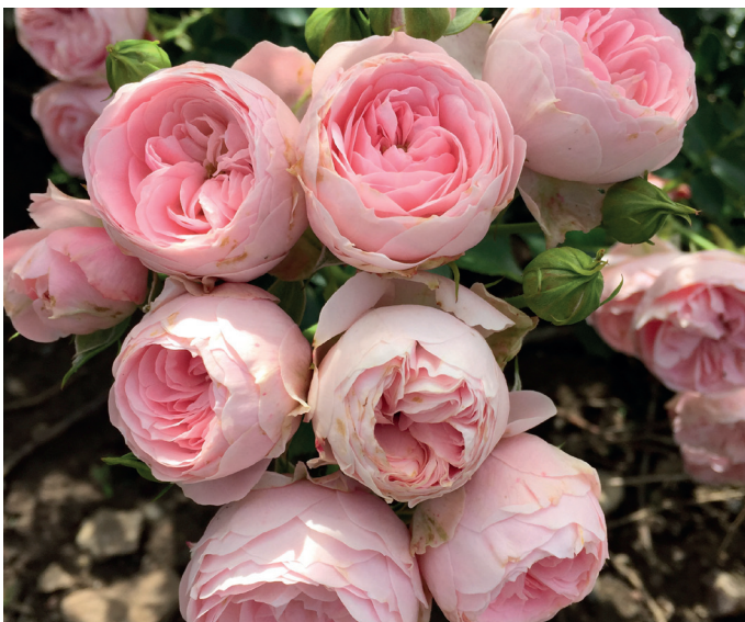
She Loves You™

Floribunda rose 80-110 cm high Remontant rose Medium filled flowers in large bunches Suitable for larger beds or solitary. Also suitable in bouquets Very romantic rose with long vase life