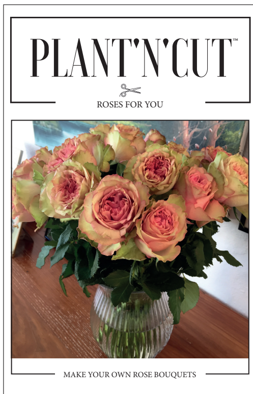
Inspirational label including care instructions