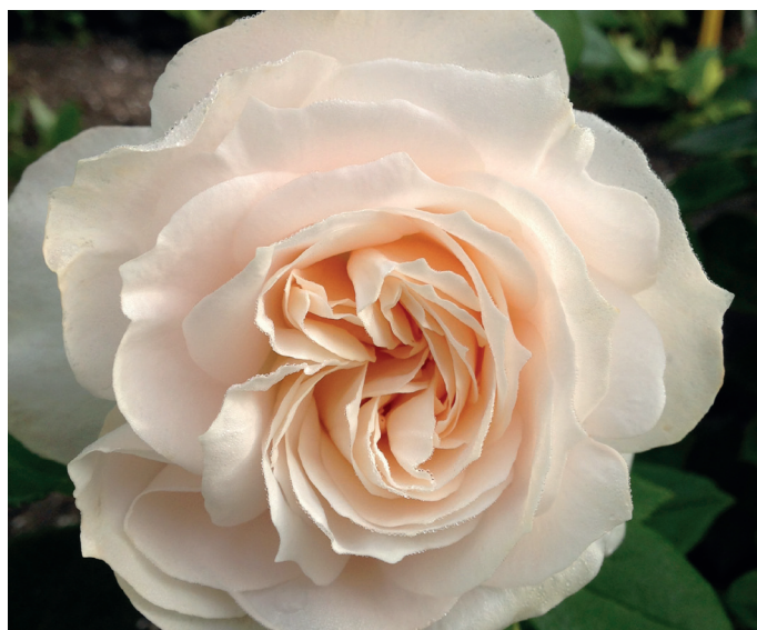
Royal Diva™ (syn. Fru Nørby™)

Gold medal winner in the rose garden "Rosenneuhetengarten Beutig" in Baden-Baden, Germany, 2015