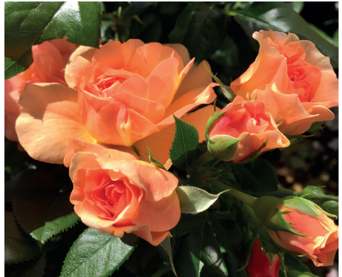
Prince Henrik of Denmark™ (syn. Prins Henrik)

Named by HRH Crown Princess Mary of Denmark at CPH Garden 2017