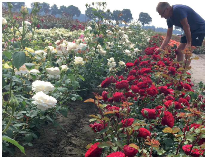
Test field in Denmark