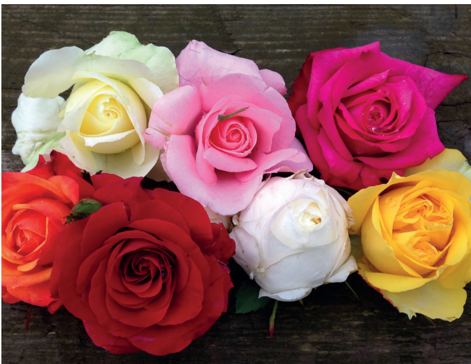
Sweet Home Roses® - Strong colours