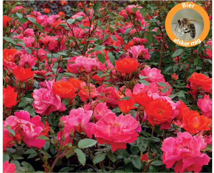
Looking in Your Eyes™

Mini ground cover rose 40-60 cm high Remontant rose Medium filled flowers with light scent Bright red semi-double flowers Use in flower beds and as a ground cover rose Also very suitable in containers