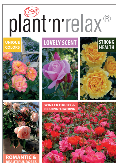
Inspirational material for the consumers

For campaigns we are happy to help with the layout and production of marketing materials. Please contact us for prices and more details.