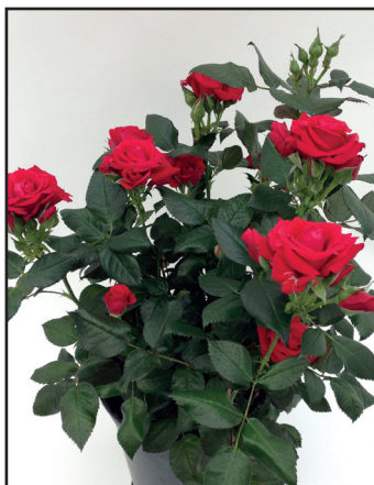
Sweet Love of Mine™