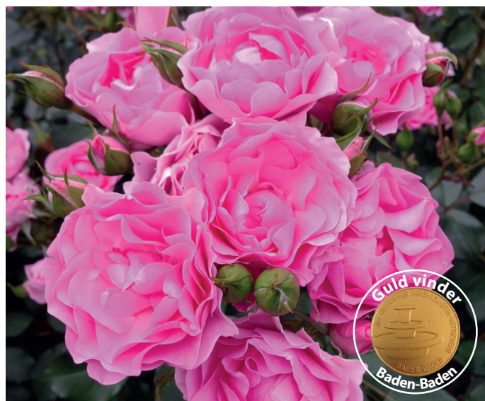
I am Grateful™

Named by the royal Danish actress Ghita Nørby and winner of many international awards