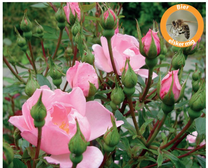
I Need You™

Floribunda rose 60-80 cm high Remontant rose Large filled flowers with light scent Very romantic rose Use in beds and containers. Also very suitable for bouquets