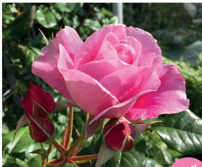
Our Last Summer™

The Inner Wheel Forever® rose supports the important work for children through the Inner Wheel organization.