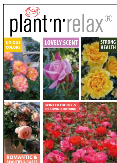
Inspirational material for the consumers

For campaigns we are happy to help with the layout and production of marketing materials. Please contact us for prices and more details.