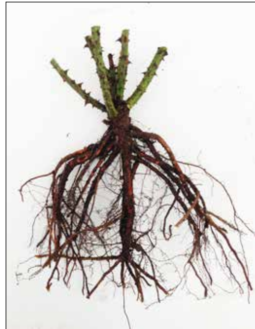
Barerooted rose ready to plant