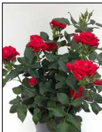
Sweet Love of Mine™