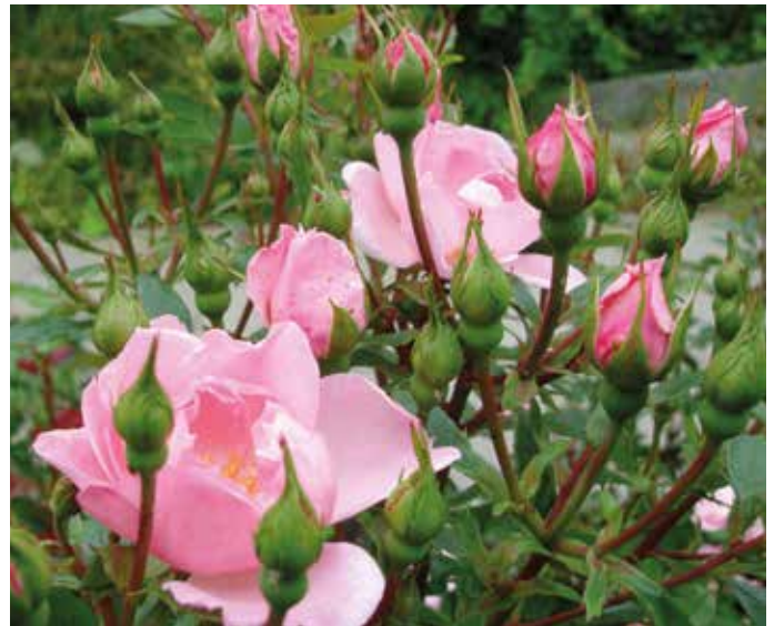
I Need You™

Ground cover rose 40-60 cm high Medium open flowers with light scent Use in flower beds and as a ground cover rose Also very nice in containers