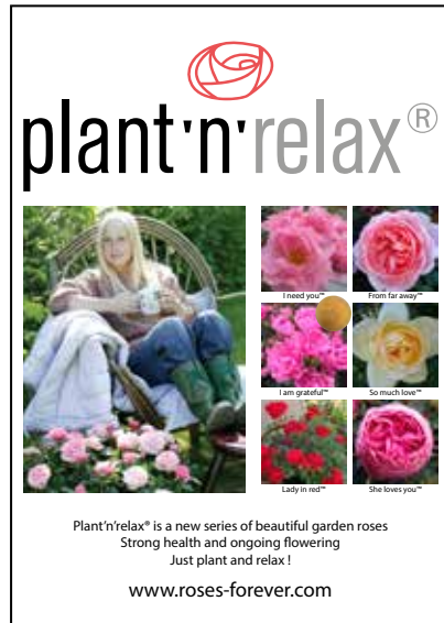
Banner, A3 or A4 sign