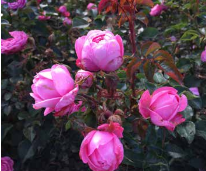
CHP Garden in Bloom™

Ground cover rose 50-60 cm high Lovely ground cover rose, also suitable in containers Filled flowers in large bunches Named by HRH Crown Princess Mary of Denmark at CPH Garden 2017