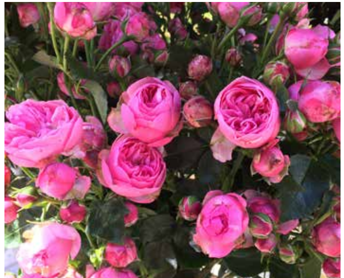
The Matador™ (syn. Lise Nørgaard™)

Floribunda rose 80-100 cm high Medium filled flowers in large bunches Very romantic rose with long vase life Suitable for larger beds, as hedge or solitary