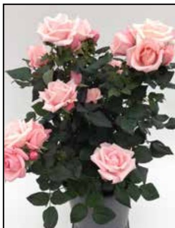
Sweet Love Forever™