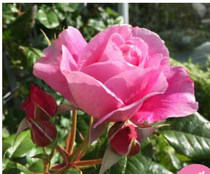
Our Last Summer™

The Inner Wheel Forever® rose supports the important work for children through the Inner Wheel organization.