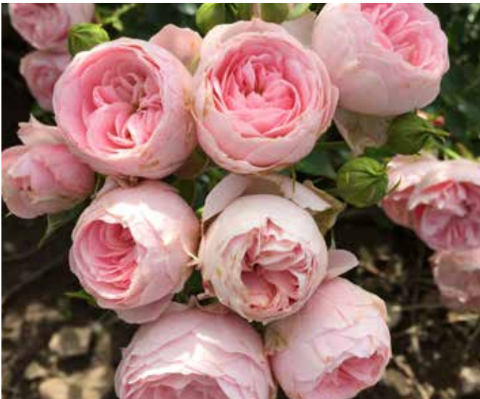
She Loves You™

Floribunda rose 80-100 cm high Medium filled flowers in large bunches Very romantic rose with long vase life Suitable for larger beds, as hedge or solitary