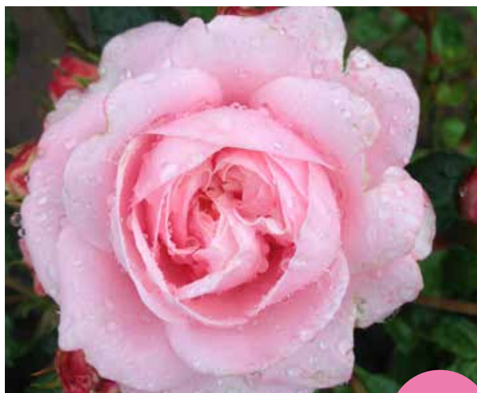
Inner Wheel Forever™