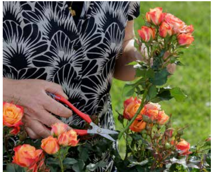
Cut beautiful bouquets

When the sun shines in spring the Plant'n'cut™ will begin to grow