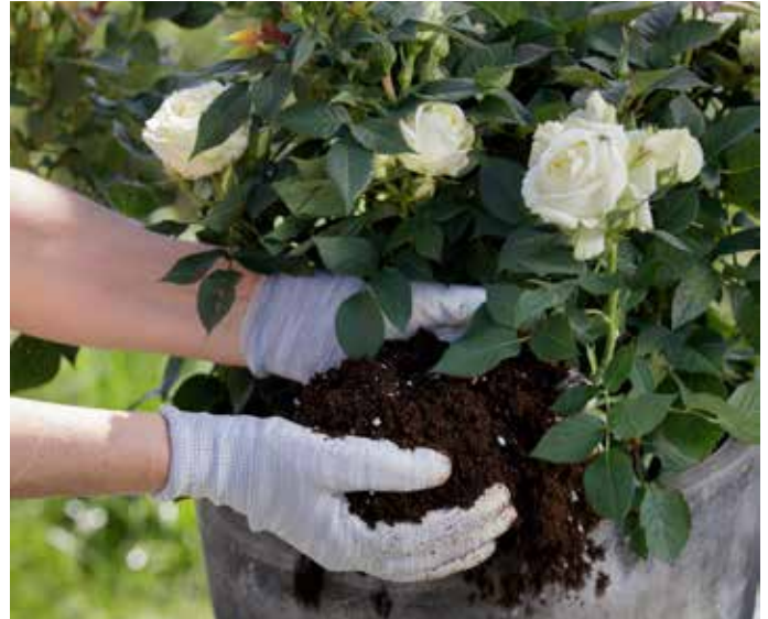
Plant the Plant'n'cut™ rose in a pot

Plant the bare rooted Plant'n'cut™ rose in a pot or bed in your hobby greenhouse