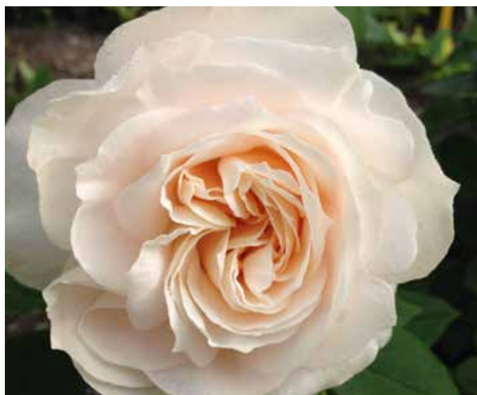
Royal Diva™ (syn. Fru Nørby™)

Climbing rose 200-250 cm high Large filled flowers with wonderful strong scent Very suitable on espalier Named by the royal Danish actress Ghita Nørby and winner of many international awards