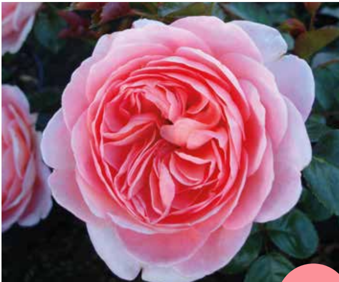
From Far Away™

Floribunda rose 60-80 cm high Large filled flowers with light scent Very romantic rose Use in beds and containers Also very suitable for bouquets