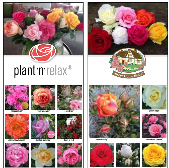
Roll-up banner 85x200cm