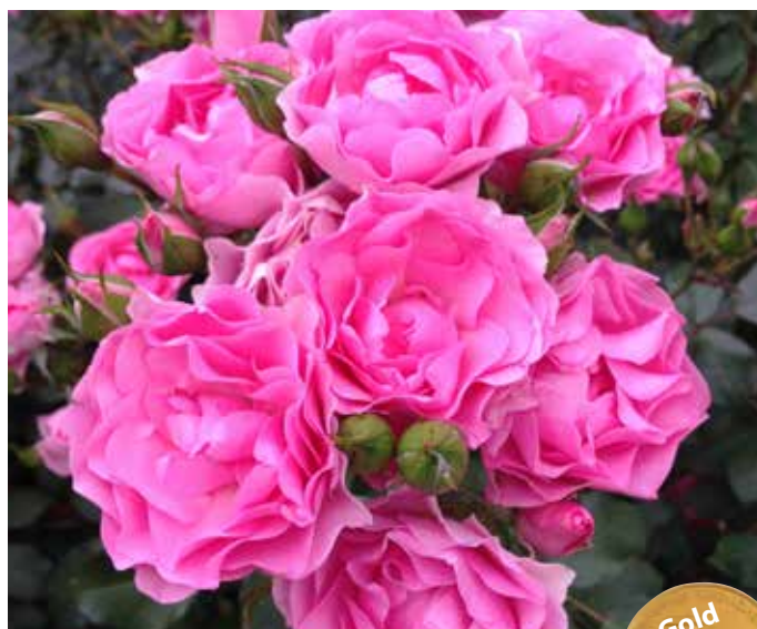
I am Grateful™

Suitable for larger beds or solitary, and in containers Named by the royal Danish actress Ghita Nørby at the Odense Flower Festival, Denmark, 2016