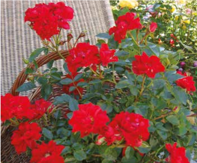
Lady in Red™

Mini ground cover rose 40-60 cm high Medium filled flowers with light scent Bright red semi-double flowers Use in flower beds and as a ground cover rose Also very suitable in containers