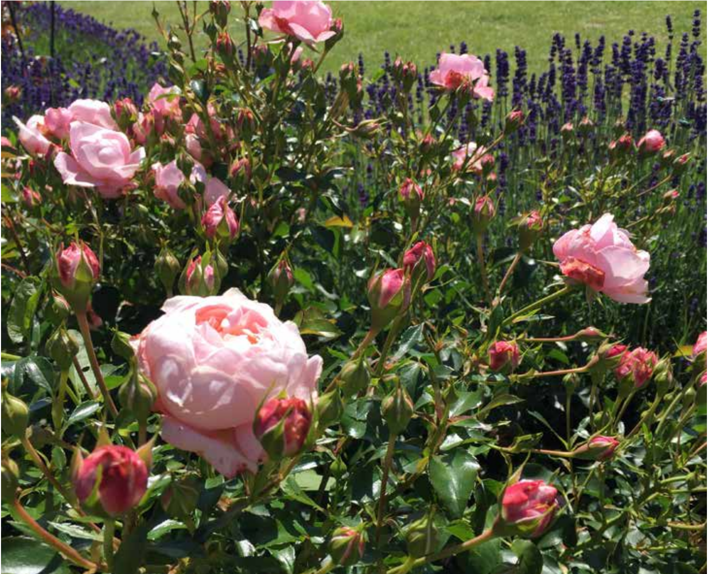
Plant'n'relax® - Remontant and healthy garden roses