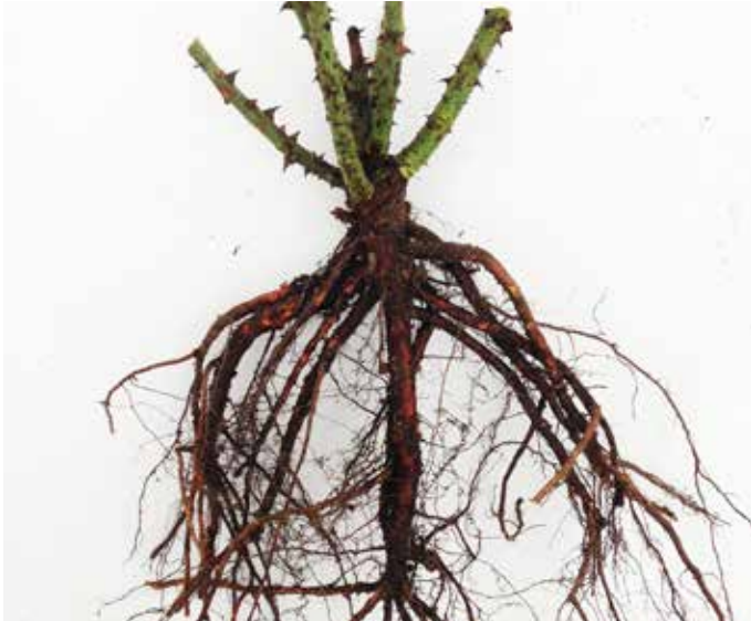
Bare rooted rose ready to plant