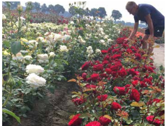
Test field in Denmark