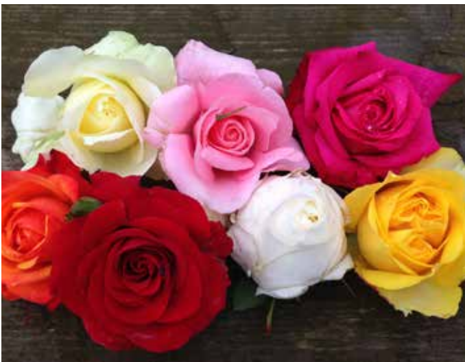
Sweet Home Roses® - Strong colours