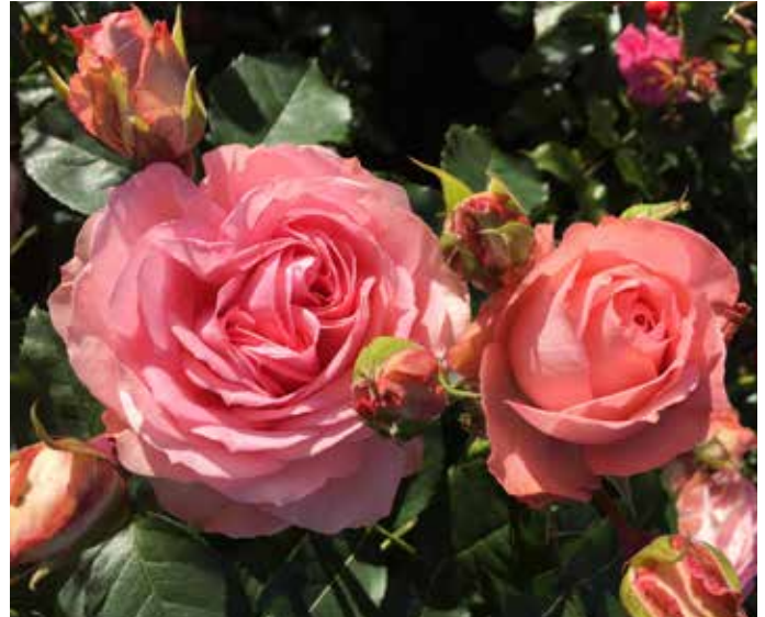
What a Wonderful World™

Floribunda rose 80-120 cm high Large filled flowers, also very suitable for bouquets Named by HRH Crown Princess Mary of Denmark at the opening of Odense Flowerfestival 2017