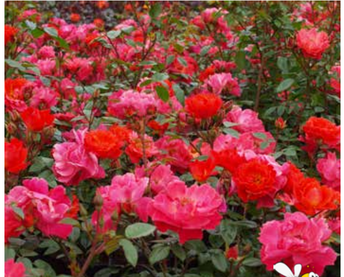
Looking in Your Eyes™

Mini ground cover rose 40-60 cm high Medium filled flowers with light scent Bright red semi-double flowers Use in flower beds and as a ground cover rose Also very suitable in containers