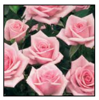
Birthday rose™ Gourmet Roses™