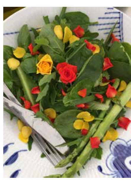
Use Gourmet Roses™ in a fresh and colourful salad