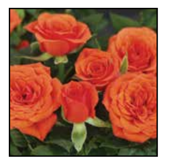
Tapas™ Gourmet Roses™