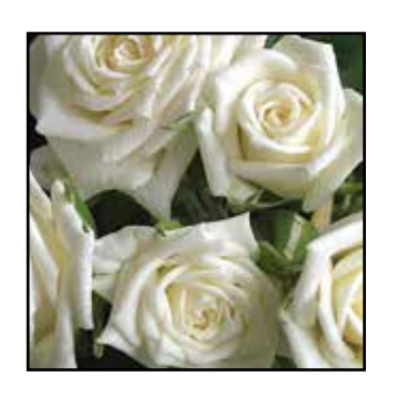
Tiramisu<sup>™</sup> Gourmet Roses<sup>™</sup>