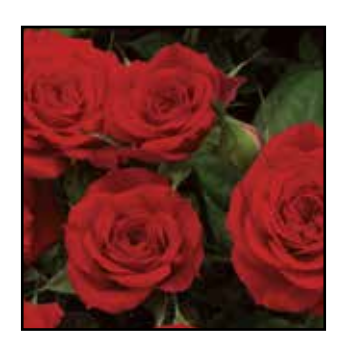
Saturday night™ Gourmet Roses™