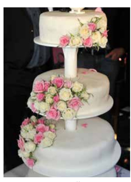
Gourmet Roses<sup>™</sup> are beautiful as decoration on a wedding cake