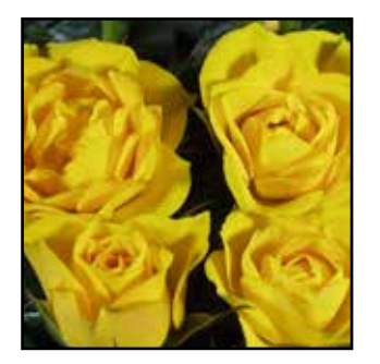
Picnic™ Gourmet Roses™