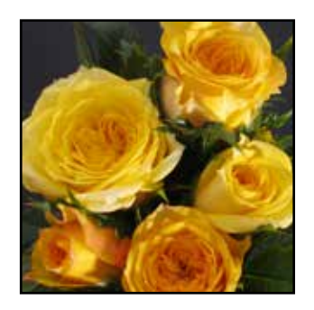
Enjoy me™ Gourmet Roses™