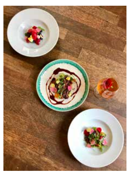
Gourmet Roses<sup>™</sup> in a 3 course menu and special brewed beer

For license to grow, prices and more information please contact Rose breeder Rosa Eskelund at re@roses-forever.com or visit our website www.roses-forever.com