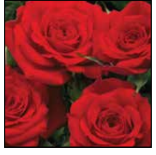
Romantic date™ Gourmet Roses™