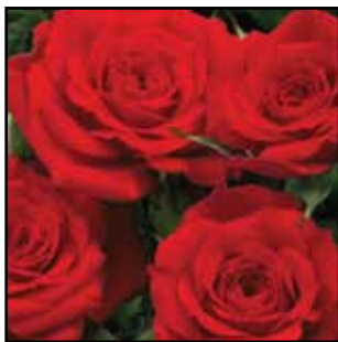
Romantic date™ Edible Roses™