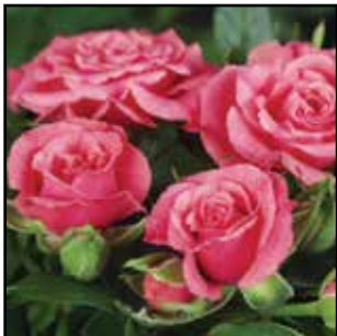
Candyfloss™ Edible Roses™