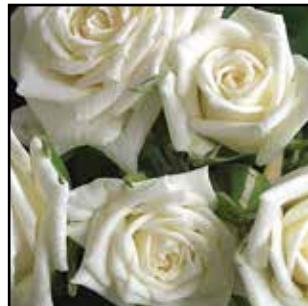
Tiramisu™ Edible Roses™