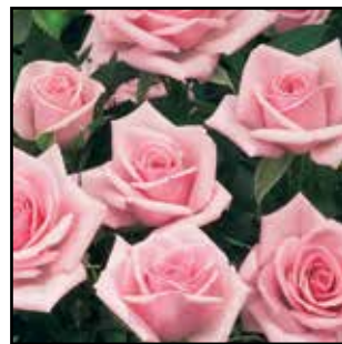
Birthday rose™ Edible Roses™