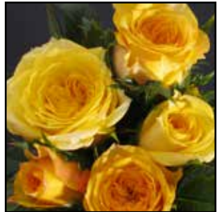
Enjoy me™ Edible Roses™

Roses Forever ApS • Fiskervaenget 9 • DK-5600 Faaborg Tel.: +45 5157 1990 • re@roses-forever.com • www.roses-forever.com