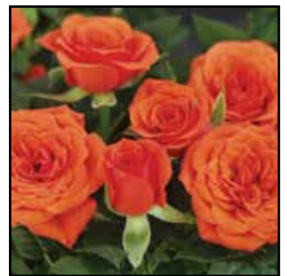
Tapas™ Edible Roses™