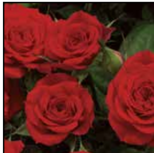
Saturday night™ Edible Roses™