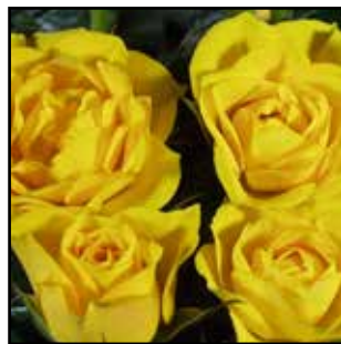
Picnic™ Edible Roses™